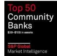
S&P Global Market Intelligence Top Community Bank with $3 billion to $10 billion in assets 2022, 2023