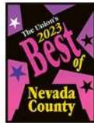
Grass Valley Union Best of Nevada County Awarded annually 2011-2023